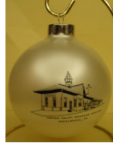
Lehigh Railroad Station