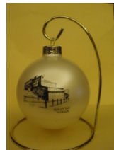
Keely Run Breaker 2009