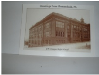
J. W. Cooper Building