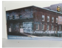
Greater Area Historical Society