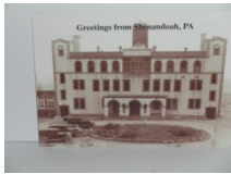
Locust Mountain State Hospital