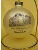
J. W. Cooper Building