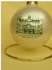
Locust Mountain State Hospital