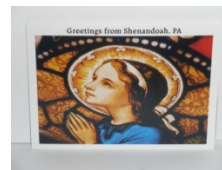
St. Michael's Ukrainian Catholic Church