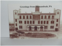
Locust Mountain State Hospital