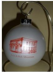
GSAHS Historical Society Building