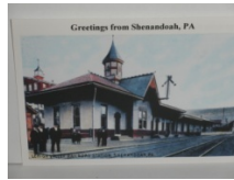
Lehigh Valley Railroad Station