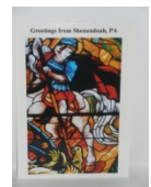
St. George's Church