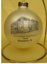
J. W. Cooper Building