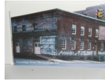
Greater Area Historical Society