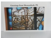
St. Casimir's Church