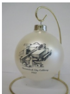
Shenandoah City Colliery 2008