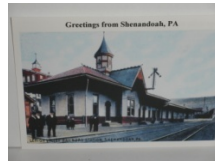
Lehigh Valley Railroad Station