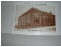
J. W. Cooper Building